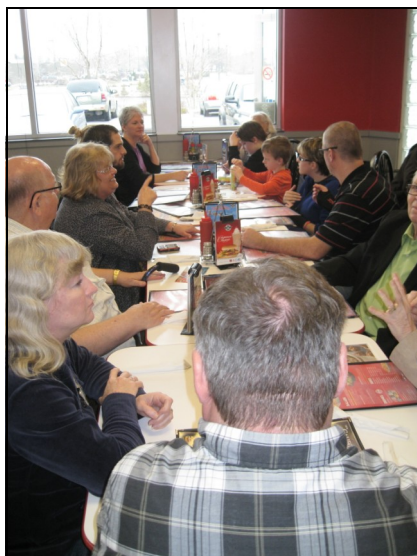
Deaf Lunch at Steak & Shake