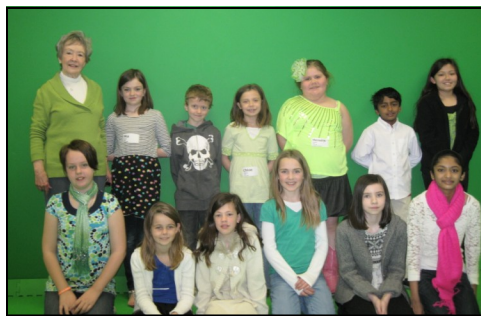
CODA class on Sundays