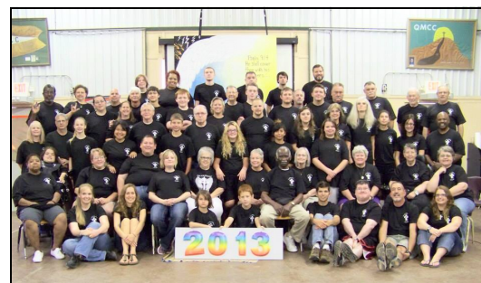
Deaf Christian Camp in Altus, OK

The kids had a wonderful time, and best of all, the Holy Spirit was really moving on the hearts of the teens. We really appreciate your financial support.